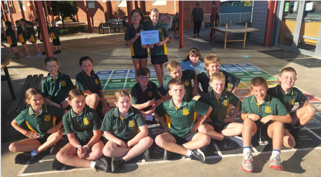
All of Grade 5!