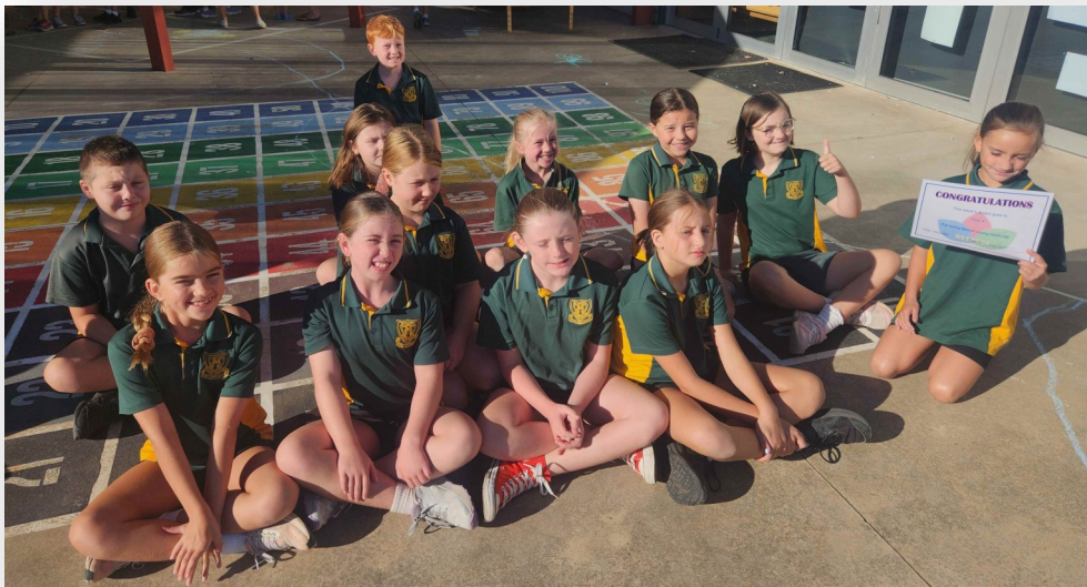
All of Grade 4!