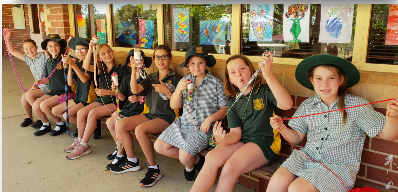
Finger knitting - the girls are making Christmas decorations for the trees to be placed around Rutherglen.