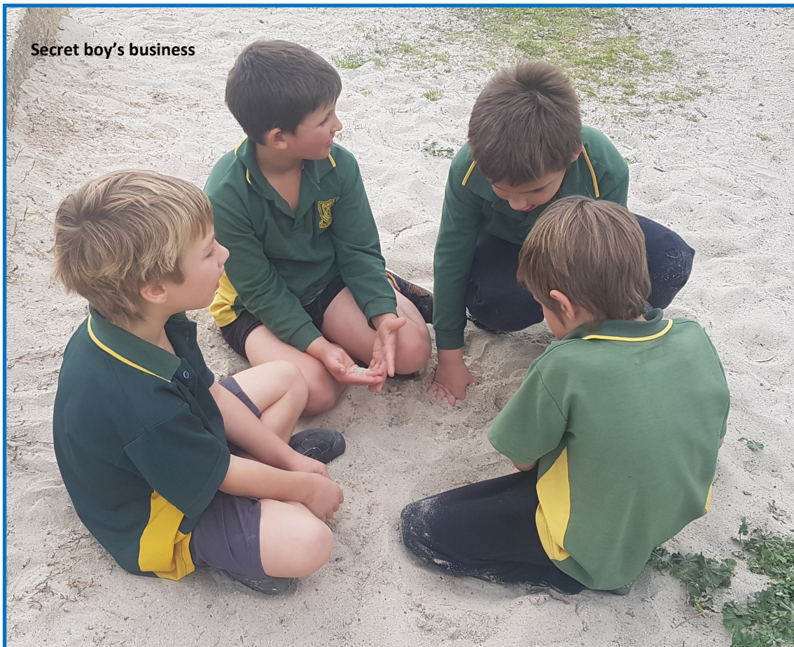
Secret boy's business