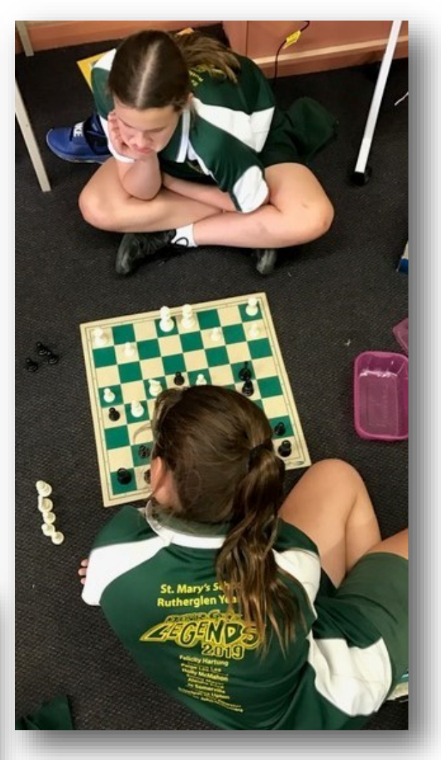
Catholic Education Week activities