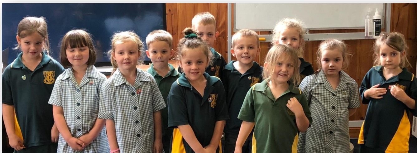
(Pictured above) - Foundation students at their first Assembly yesterday.

Assembly this year will be held every 2nd Tuesday afternoon at 3pm. We had our first assembly yesterday. Changing the time to 3pm provides a great opportunity for parents picking up students at the end of the day to arrive a little earlier and join us for assembly. Our next assembly is on Tuesday 19th February at 3pm.