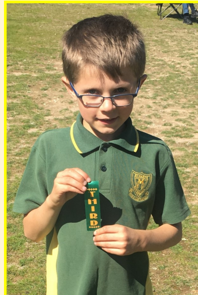
Cross Country @ Chiltern Golf Course Friday 7th September, 2018