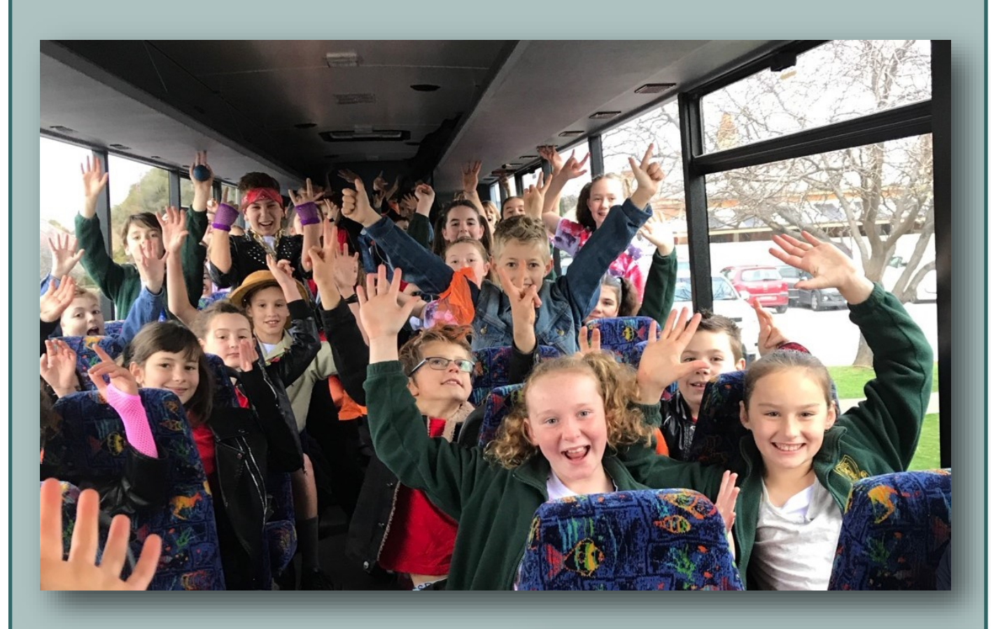
Excitement mounts as the bus leaves for Stage Door