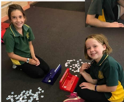
Catholic Education Week activities