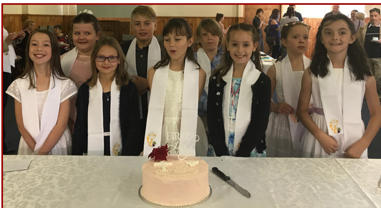
First Eucharist - Sunday 29th April, 2018